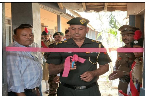
Blood Donation camp inauguration by Guest