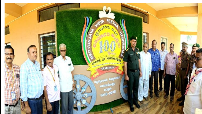
Launch of the Centenary Logo