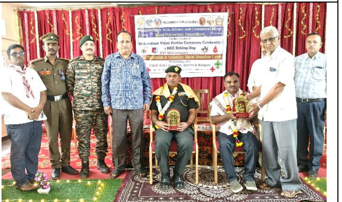
Felicitation to Cheif Guests