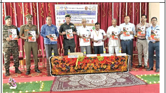
Launch of the 4 th edition of the Uttishtha magazine