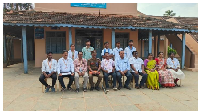
Group Photo with Blood bank Team