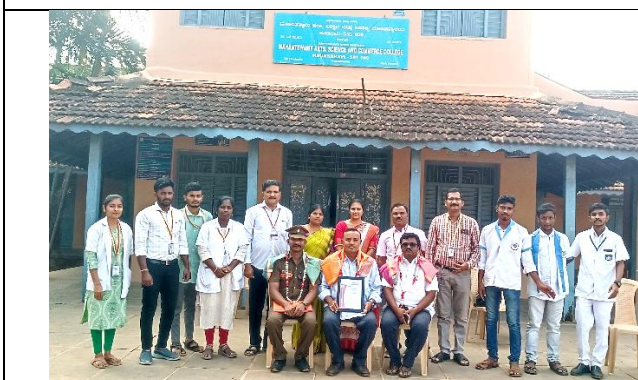
Appreciation Letter Received by Priciple from Blood Bank Haveri